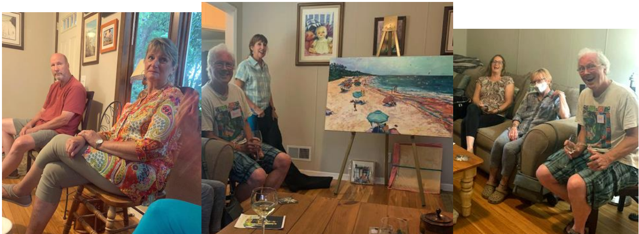
August art night.