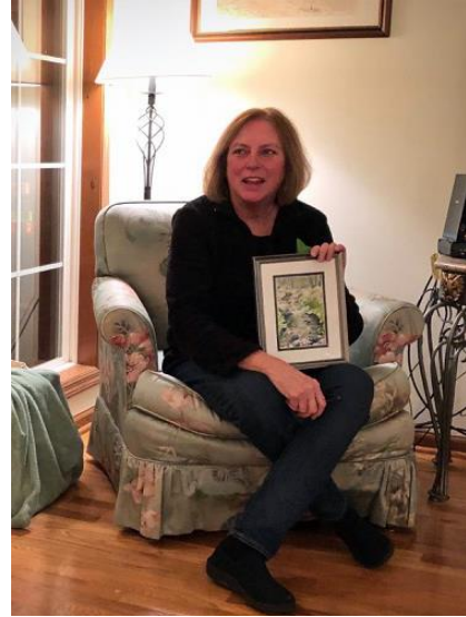
November Art Night