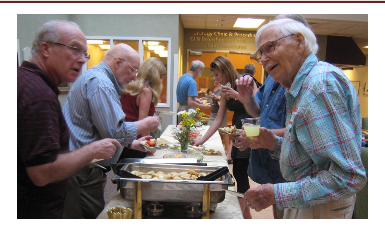
Madison Art Guild Salon Reception 2012